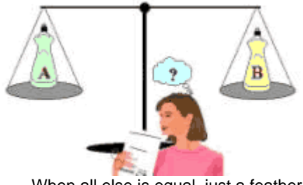
When all else is equal, just a feather like reinforcement-reminders, can tip the balance.

The data from the Du Plessis study and the data from a 2006 study by Goode<sup>4</sup> (for Sky TV) confirm the original reminder effects but they also reveal an emotional impact for ads seen before. When they are viewed in fast-forward, the emotional response of how much we liked the ad when we saw it at normal speed looks to be fleetingly retriggered.